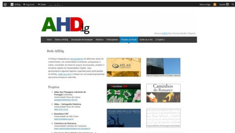
Fig. 5: Associação das Humanidades Digitais (01.09.2014)

in a period of transition. Taking into account the generic feature that is usually associated with this field – a strong link between research in the Humanities and the incorporation of methods and tools from Digital Technologies – then the practice and the practitioners of Digital Humanities in Portugal stem from the 1980s. On the one hand the Portuguese academic „mainstream“ has never regarded this field favourably, yet it never failed to make its way – sometimes a rather individualistic way, without too many contacts and collaborations between researchers or research groups. On the other hand, the appropriation of a new, imported discourse has so far not assumed the character of an „overwhelming wave“, much to the contrary. Nevertheless, recent developments show broad acceptance for the need to renew the affirmation of a perspective for research, practice, teaching and outreach that is increasingly interdisciplinary, collaborative and internationalized.