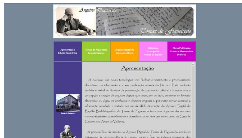
Fig. 1: Tomaz de Figueiredo's Digital Archive (01.09.2014)