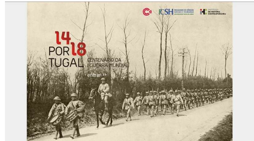
Fig. 4: Portugal 14-18 (01.09.2014)