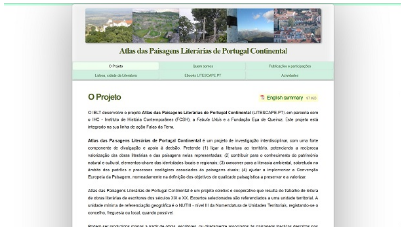
Fig. 2: Atlas of Literary Landscapes of Mainland Portugal (01.09.2014)

The entanglement of the Humanities with digital technologies in Portugal has not been limited to the digitization, analysis and academic publication of texts. Major steps forward have been taken in the areas of Intangible Heritage, Music and Dance, or Art History in recent years, using diverse technologies, with an emphasis on digital video and sound to preserve popular culture 16 , in multimodal analysis about performing arts 17 , on 3D reconstruction 18 or on historical modelling in virtual environment 19 , of which the most recent and promising exam-